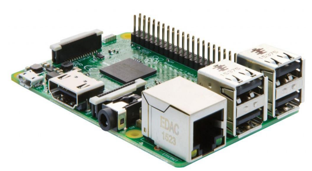
Fig: Raspberry pi board